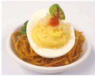
Devilled Eggs Wonderland