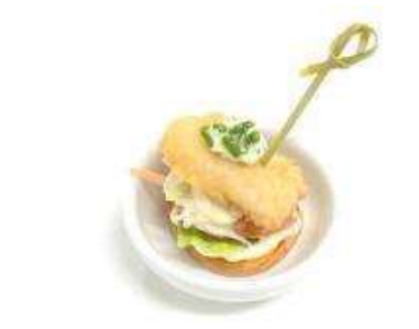
Messy Fish Sandwich Hooked