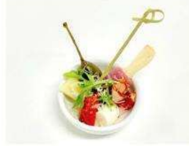
Antipasti Jamie's Italian