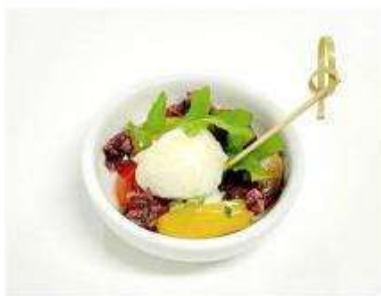
Mozzarella Salad Giovanni's Kitchen