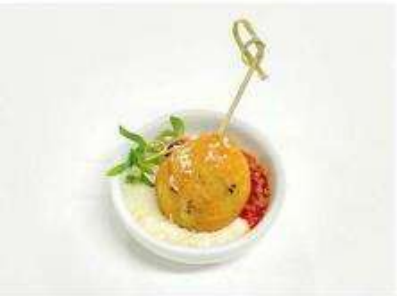
Mushroom Arancini Giovanni's Kitchen