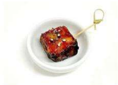
Black Pepper Bacon Chops Grille