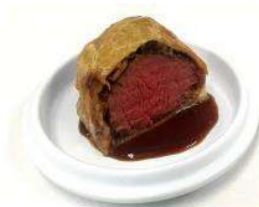
Mini Beef Wellington Festive Dining