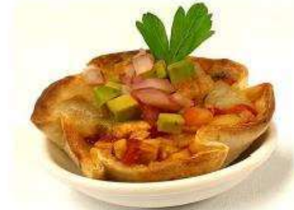
Chicken Enchilada Cup Sabor