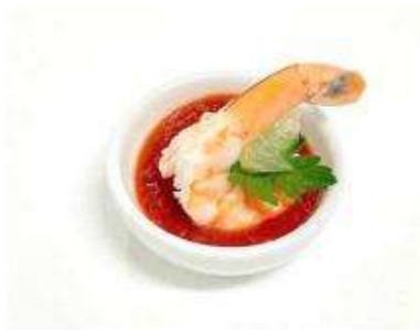
Shrimp Cocktail Chops Grille