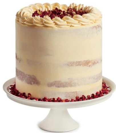
FLORAL AND GOLD