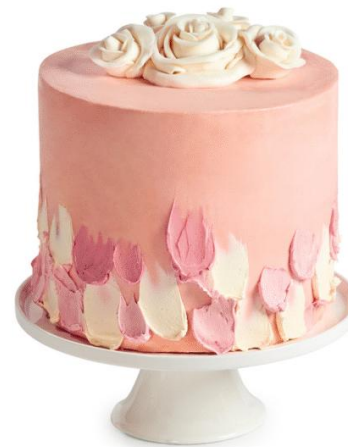
LOVE IS IN THE AIR