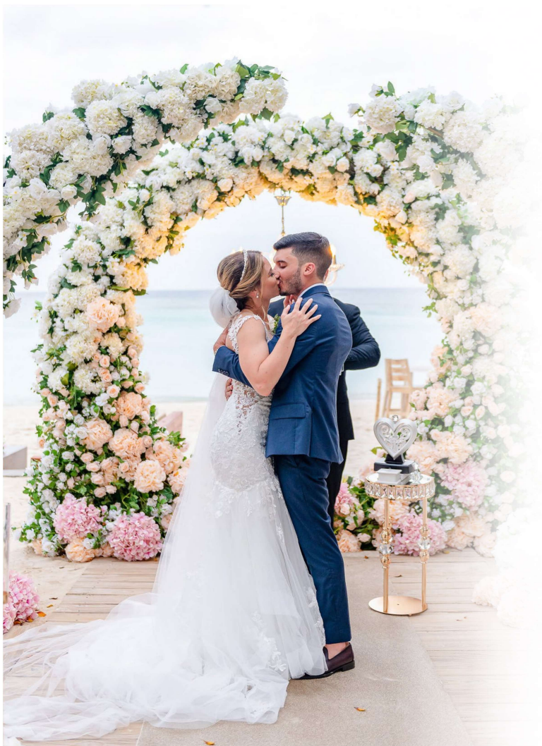
All shoreside beach venues may not be private. Photo includes enhancements available for purchase in select locations through vendor.