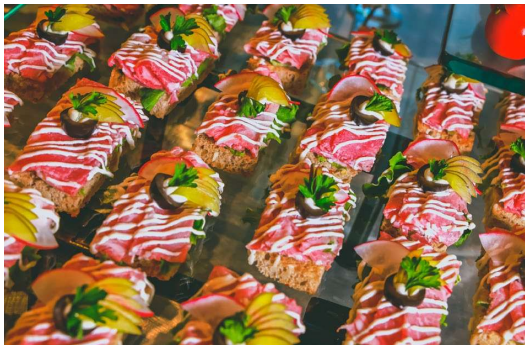
COLD - CHOOSE 4

Receptions are 1 hour with the option to extend in ½ hour increments a la carte; Weddings with non-sailing guests cannot exceed 1 hour and 30 minutes; All extended receptions purchased a la carte are subject to venue availability.