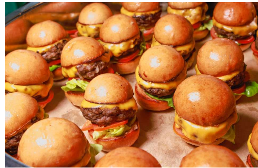
HOT - CHOOSE 4

Cherry Tomato with Fresh Mozzarella (V) (G) Roast beef with Horseradish Cream (G) Marinated Scallops in Rice Paper Shrimp Rolls in Crispy Philo (D) Yellow Tail Snapper with Cilantro Jelly or Wonton Skin (D) Lobster Roll in Butter Bun