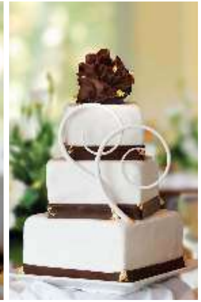
SIMPLE AND SWEET